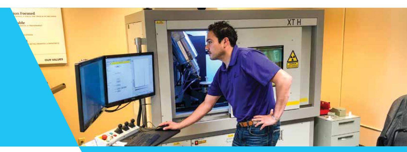
Trust IIA to be your testing partner.