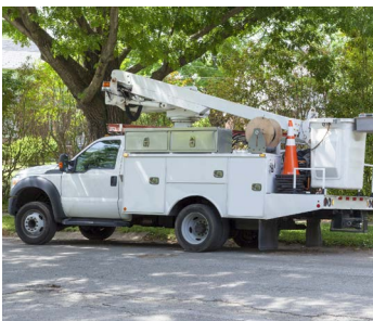
Aerial Devices & Digger Derricks