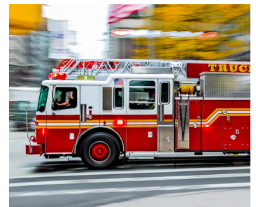
Fire Department Testing