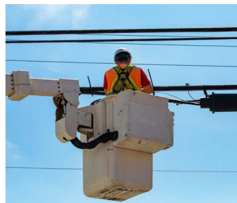
Live-Line Tools & Rubber Goods Testing